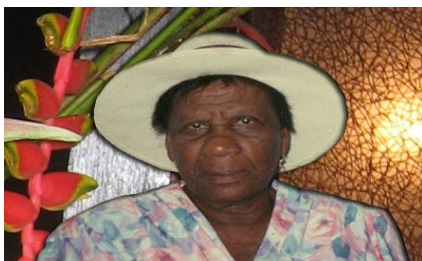
Man-Ya Single mother of six.

The feeling of internal value is the key to being of value to others. When we are lacking in a feeling of internal value is when we are plagued with low self-esteem.